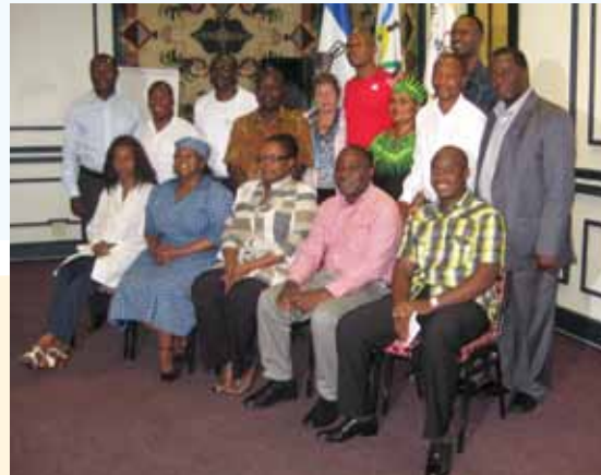
At the Maseru Forum organised by IOC/CUAHA