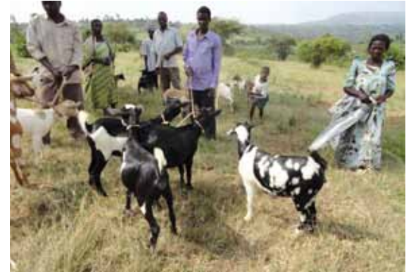
Local Leaders participate in the distribution exercise

A major learning is that training for recipient family members especially on goat management practices including pest control, feeding, hygiene and sanitation has enhanced the success of the project while also reducing beneficiary dependence on the project. This year has experienced a long drought period leading to water scarcity specifically for animal consumption as well as for domestic use. The ever increasing number of vulnerable orphans in need of support as opposed to the available resources. This increase means giving 1 or 2 goats per family hence delaying the desired change as well as failing to create meaningful impact.