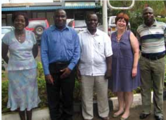
At the BIA Board meeting