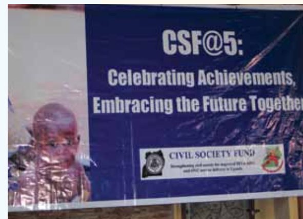
RACOBABO celebrated CFS's 5 years contribution to HIV/AIDS prevention care and support in Uganda

RACOBABO has also established condom distribution outlets in the communities where condoms are easily accessible.