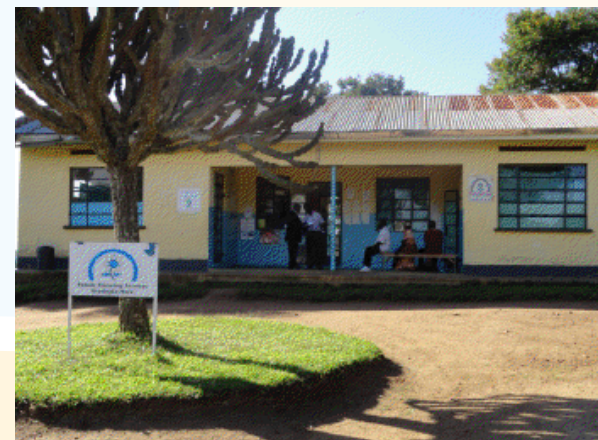
Kinuuka HCIII, the first ART accredited HCIII in Lyantonde District.

RACOBABO was supported with a project by Pharmacists without Borders (FuG) Sweden, to train the Lower level health workers. The 2 weeks training curriculum was designed by Uganda cares and certified by the Ministry of Health. The trainers were drawn from TASO Uganda, FuG, and Uganda Cares.