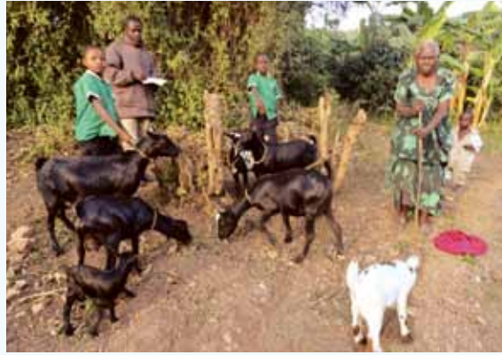
Goats for vulnerable families