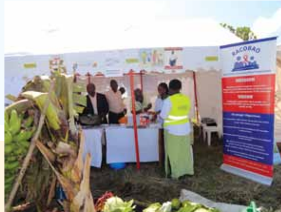
DCA sponsored tent for Rakai/Lyantonde Partners at the World Aids Day