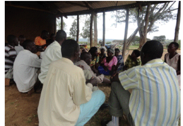
Community dialogues to develop community plans involve men

nity. RACOBABO will continue to address all barriers to men's participation if meaningful HIV prevention efforts are to be achieved and sustained. We thank CSF for the support towards this success.