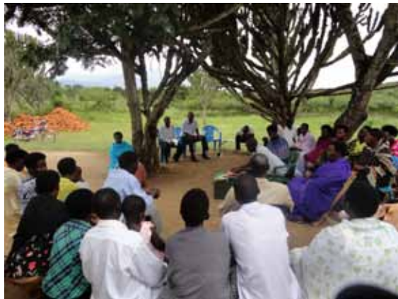
Women are supported to challenge their subordinate role in Society

In 2012, RACOBABO began implementing a four year project (2012-2015) aimed at ensuring that vulnerable groups, especially MARPS (Commercial Sex Workers, Married and in long-term relationships-women 30-35 and men 40-45), PLHIV, and CHH are empowered to claim for their rights and