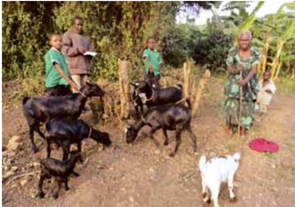
Goats provide Social & Economic Security for vulnerable families

This year, RACOBABO utilized the grant from ELCA to implement the Rakai Livestock Project aimed at promoting socio-economic initiatives of HIV and AIDS affected families. This was mainly through distribution of 280 goats, establishment of 30 vegetable