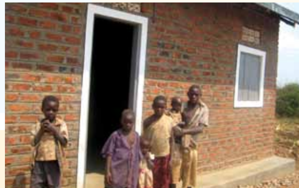
One of the families that benefited from ICA support in 2012