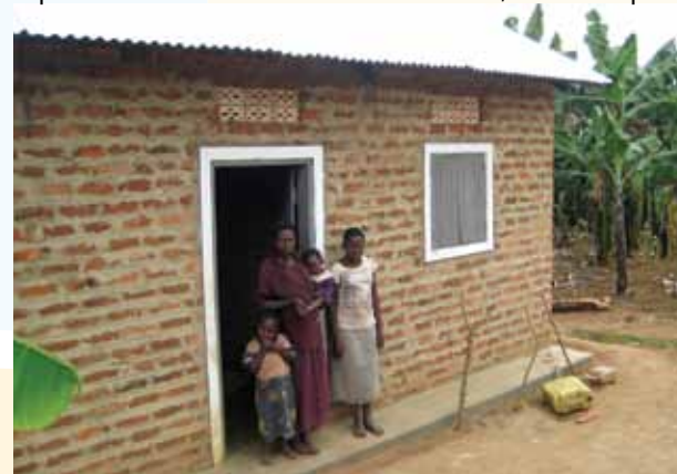
Before and after a vulnerable family acquired a New house and toilet through the BIA Support.