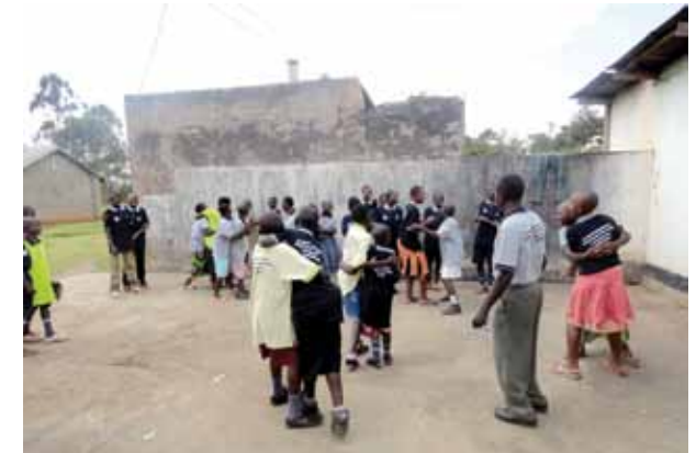
Orphans undergoing a sharing event during the Youth Camps

well being. All appreciation goes to Children in Africa for the support.