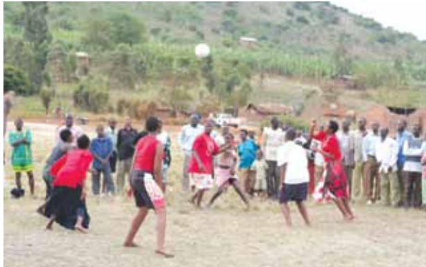
Sports events like this one were used to disseminate HIV/AIDS information

In 2012, RACOBAAO as the lead agent for CUAHA Uganda in conjunction with the NOC partnered with the International Olympic Committee to scale up HIV and AIDS response in Uganda through Sports in the districts of Lyantonde, Rakai, Kampala and Luwero. This followed an earlier project in 2011 implemented collaboratively with Pentecostal Churches