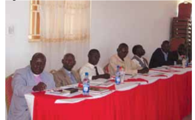
Religious Leaders trained using the IOC tool kit

In this collaborative project, CUAHA partnered with the local NOC delegates during implementation of activities at the local level as well as with the district Federation of Uganda Football Associations (FUFA) delegates in organizing the sports competitions. During training of TOTs, health personnel from the office of the DHO as well as the District HIV focal person were the main trainers who facilitated all the trainings. In Ministry of health approved training materials and curriculum, the toolkit was a supplementary training tool.