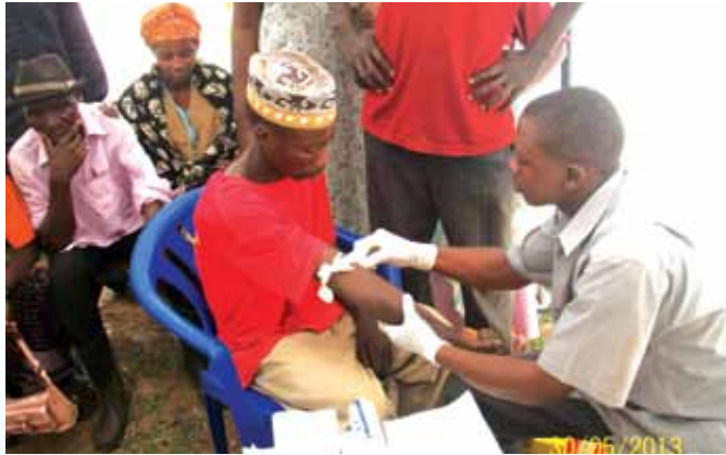
A man testing for HIV/AIDS at Lwanga Landing site.

they often miss out on the normal HIV services that take place during day time while they fish. The safe sail boat has attracted so many fisher folks. It has attracted large numbers compared to two years ago. This has given health workers the opportunity to sensitize them about the; Importance of HCT, Importance of condom use, sexuality and life skills, stigma and discrimination, and detection and treatment of STIs.