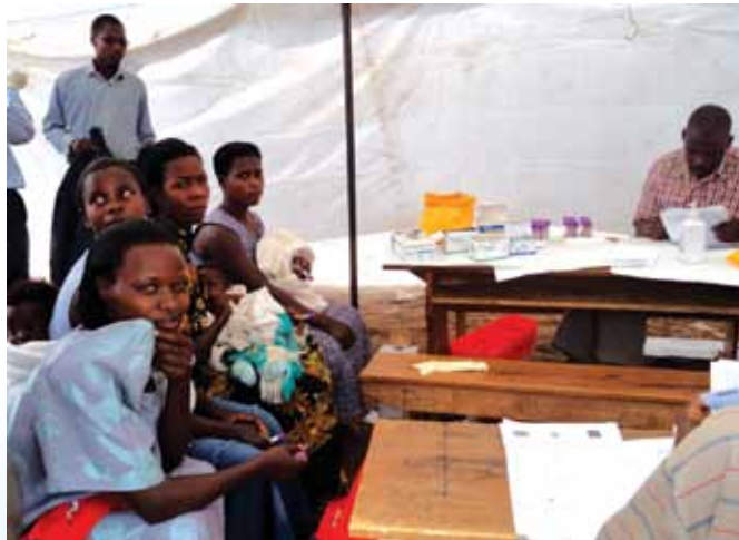
Women, men and children accessing HIV Counselling and Testing services at Lwebiriba landing site

Funded by the Civil Society Fund (CSF). Using the new HIV combination prevention strategy in four sub counties in Rakai district; Lwamagwa, Dwaniro, Kacheera and Kagamba. The Project targets MARPS (commercial sex workers, fisher folks, truck drivers, Boda boda cyclist, youth out of school, people in long-term relationships and People Living with HIV/AIDS).