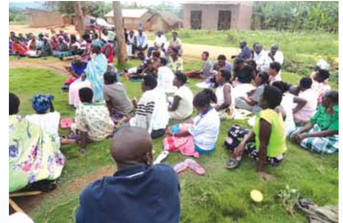
A Community Barazar conducted to sensitize rights holders on how to claim for their rights against harmful cultural practices, gender based violence and discrimination.

Funded by Dan Church Aid aimed at strengthening capacity of duty bearers to fulfill their mandates as well as empowering rights holders to claim for their rights against harmful cultural practices, sexual and gender based violence, and discrimination.