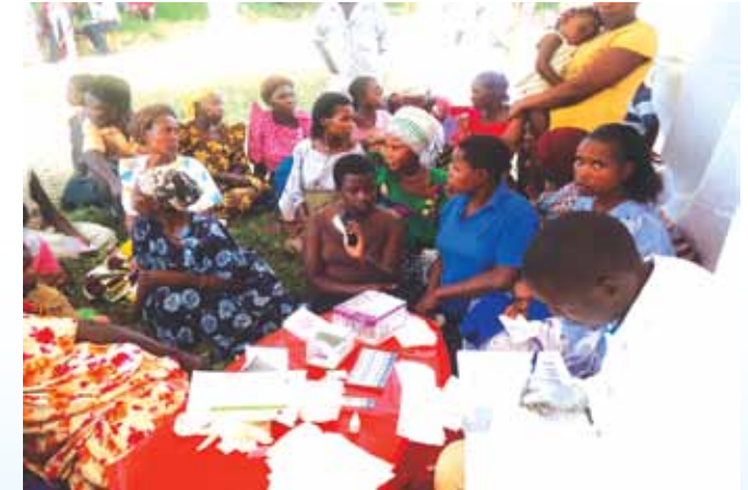
Community members of Kabumba Landing Site accessing HIV counselling and testing services