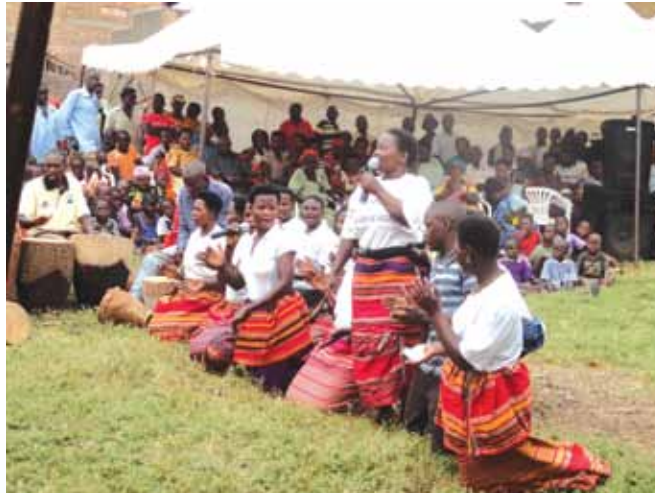
A group of People Living with HIV/AIDS from Ddwaniro sub-county supported by RACOBABO with funds from Civil Society Fund delivering anti stigma and discrimination messages through music, dance and drama during the WorldAIDS Day Celebrations held at Kiziba sub-county in Rakai district.