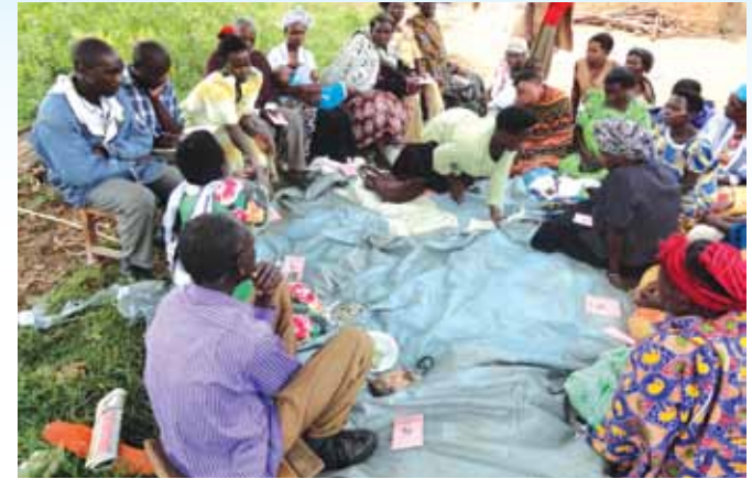
Members of Nkoote Village Savings and Loans Association during a Share out.