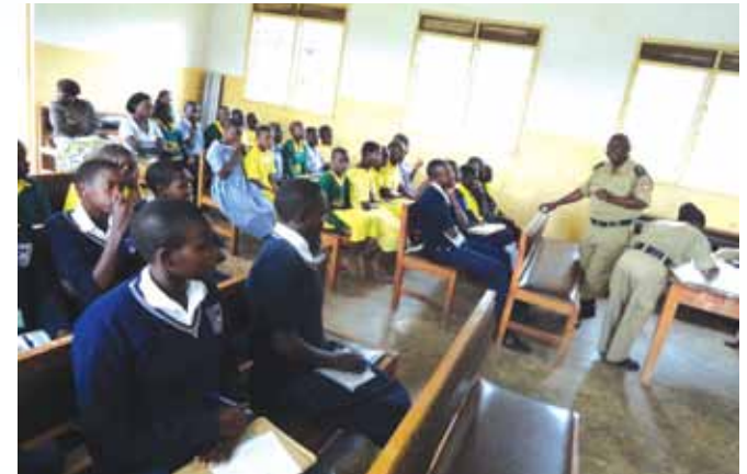
A dialogue meeting between rights holders and duty bearers on Child Rights Protection

Funded by Independent Development Fund (IDF) mainly targeting early marriages and land grabbing for orphans and widows (PLHIV).