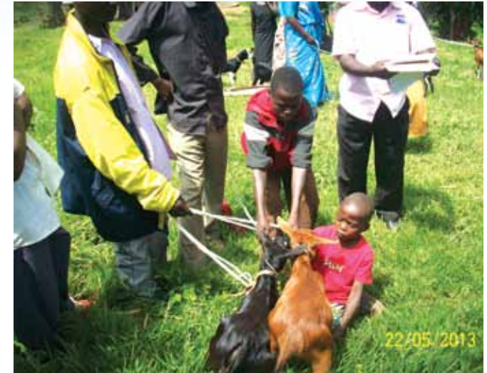
Orphans receiving goats

Provided Goats to Vulnerable Children and Orphans for rearing.