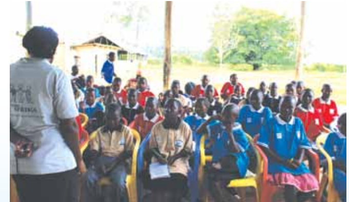
Orphans and Vulnerable Children during a Learning and Experience Sharing Camp conducted by RACOBABO.