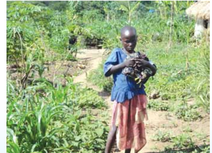
An emotionally and psychologically tortured orphan

The participants made action plans that are followed to protect child rights, address violation of children rights and pledged to play their roles for a successful Child Rights Protection Project in Lyantonde district. RACOBABO would like to thank IDF for this partnership.