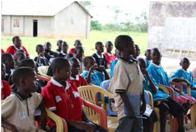
Orphans and Vulnerable Children during sharing

Funded by Children in Africa (BiA) operating in Lyantonde and Rakai Districts. The project aims at improved living conditions among Orphans, Vulnerable Children and People Living with HIV/AIDS. This enabled the construction of 3 houses, 3 latrines and facilitated Camps where Orphans and Vulnerable Children share experiences.