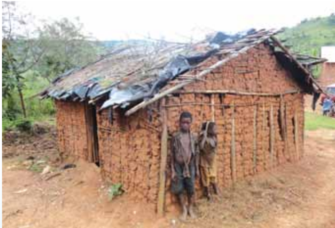
Kawungu's Family Before Aid through RACOBABO.

Funded by Icelandic Church Aid. This Project enabled the construction of 7 houses, 7 latrines, 7 kitchens, and 7 water tanks benefitting over 50 PLHIV and orphans from Child headed households.