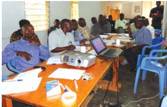
Participants in the OCA meeting

To define the critical success factors that will influence RACOBABO's future performance and to identify and set relevant indicators for measuring and evaluating RACOBABO competency.