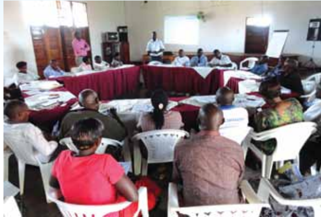
Lyantonde District stakeholders during the launch of the Community Based Child Rights Protection Project.

Therefore through this project, the capacity of Duty bearers including Local government, traditional and religious institutions is strengthened to take actions towards effective elimination of child rights abuses.