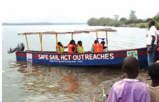
Health workers landing at Lwanga Landind site to carry out HIV Counselling and testing services.