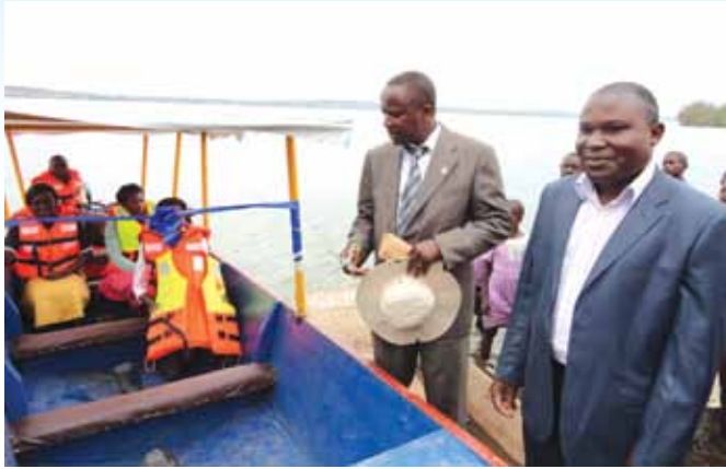
The L.C.V Chairperson of Rakai district launches a Safe Sail Boat at Lwanga landing site on Lake Kacheera.