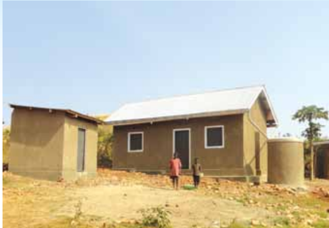
Kawungu's Family After Aid through RACOBABO.