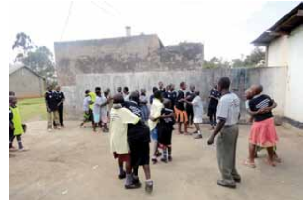
Orphans undergoing a sharing event during the Youth Camps

well being. All appreciation goes to Children in Africa for the support.