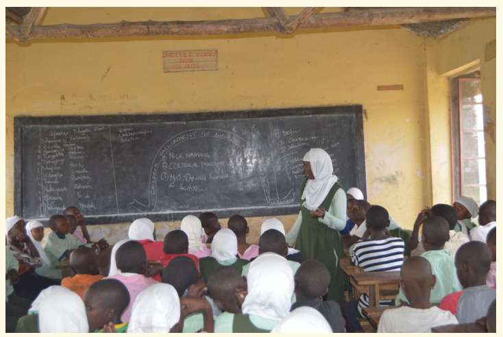
Children parliament at Kyabbuuza Primary school

ment, early marriages, child labour to be majorly affecting them. They recommended that the duty bearers should address them for their well being. promised to change the situation by for example trying to administer positive discipline instead of corporal punishment.