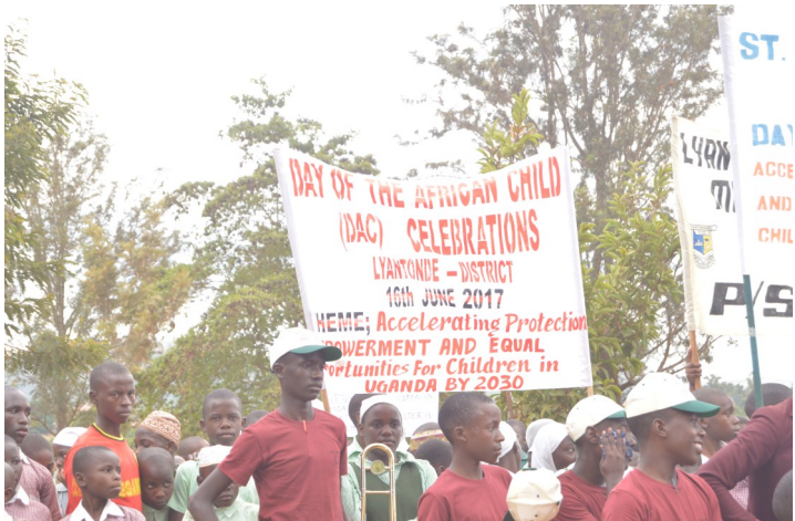
Children marching on streets of Lyantonde District proceeding to the DAC event venue