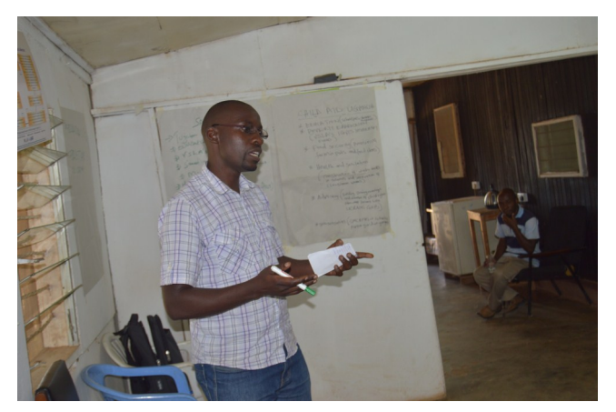
Figure I Field Officer Salaama Shield foundation outlining some of the OVC work they engage in

RACOBAO conducted a quarterly interface meeting in Lyantonde Town council, targeting members of community structures. The purpose of the meeting was to discuss service delivery and establish an effective referral system. This meeting attracted an attendance of 20 participants 5 females