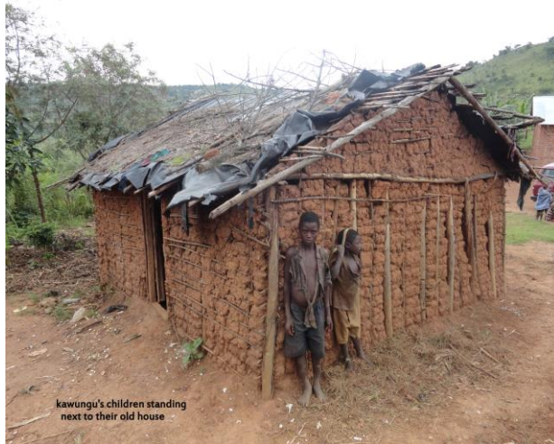
kawungu's children standing next to their old house

Through this project, RACOB AO has improved the living conditions and household sanitation among families of children living alone and people living with HIV and AIDS.