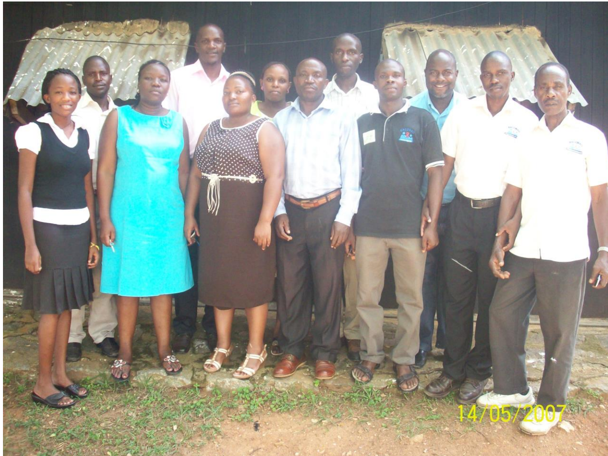
A group photo showing the current RACOBAAO staff.