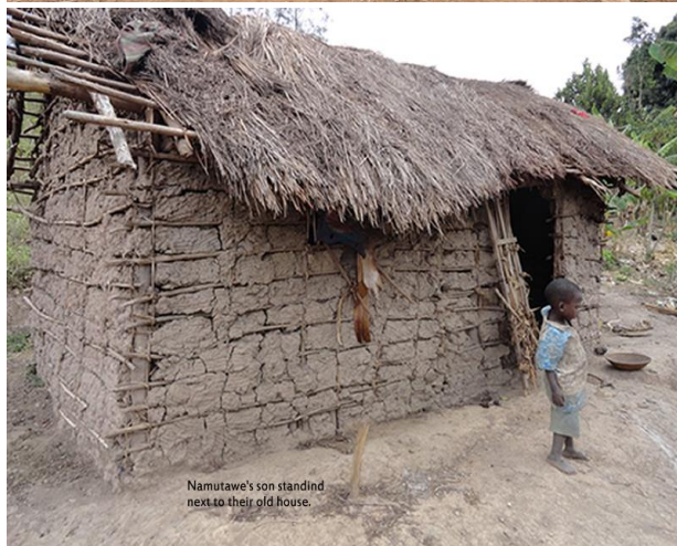
Namutawe's son standing next to their old house.