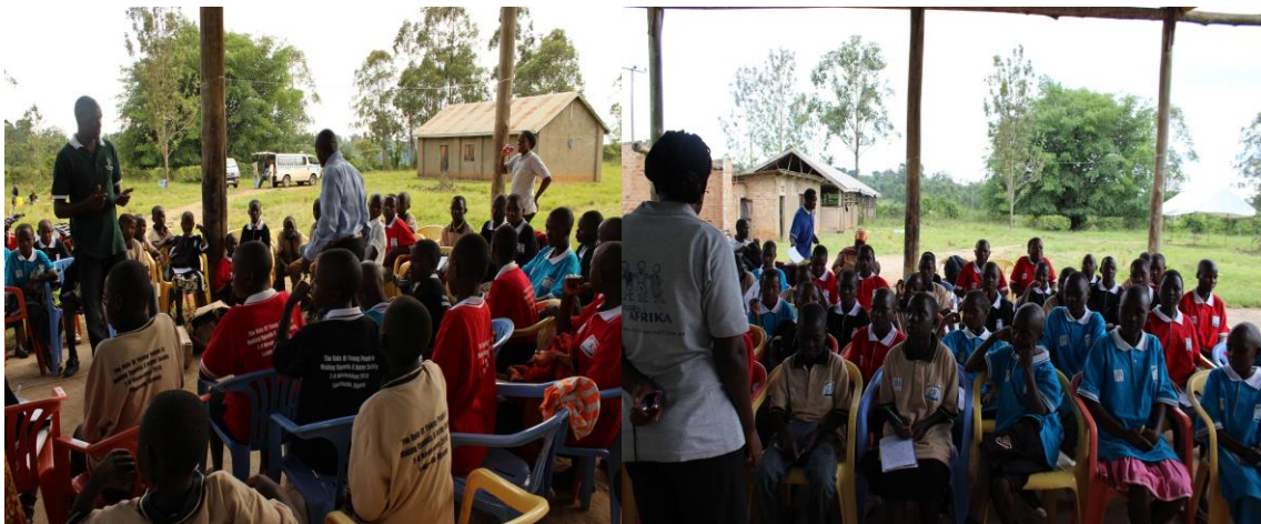
RACOB AO conducted a 02 days camp for orphans from Child Headed Households.