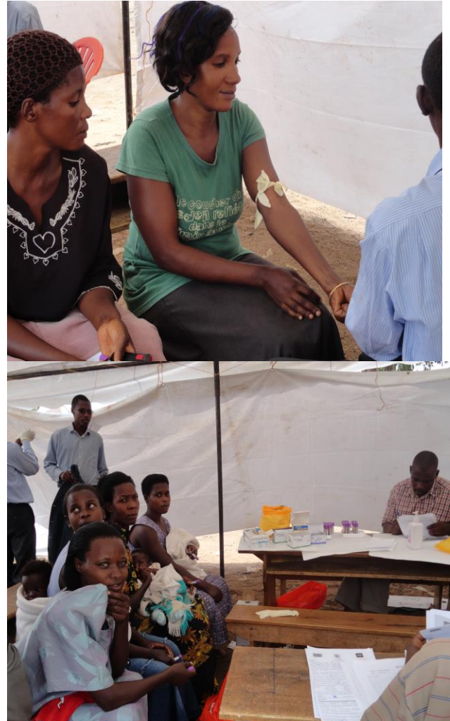
Women and men attending the HIV/AIDS Counseling and Testing services at Lwanga landing site during an outreach on Lake Kacheera.

Through this project in the 04 sub-counties of Kacheera, Lwamaggwa, Dwaniro and Kagamba, RACOB AO aims at; Increasing demand and utilization of HIV prevention services among men and women, Increasing adoption of safer sexual practices, creating a sustainable enabling environment to mitigate socio-cultural and structural drivers of HIV/AIDS epidemic, Strengthening coordination and referral mechanisms among HIV/AIDS service providers, Strengthening the monitoring and evaluation system of RACOB AO and the consortium members to monitor and measure project outputs and outcomes in the targeted sub counties.