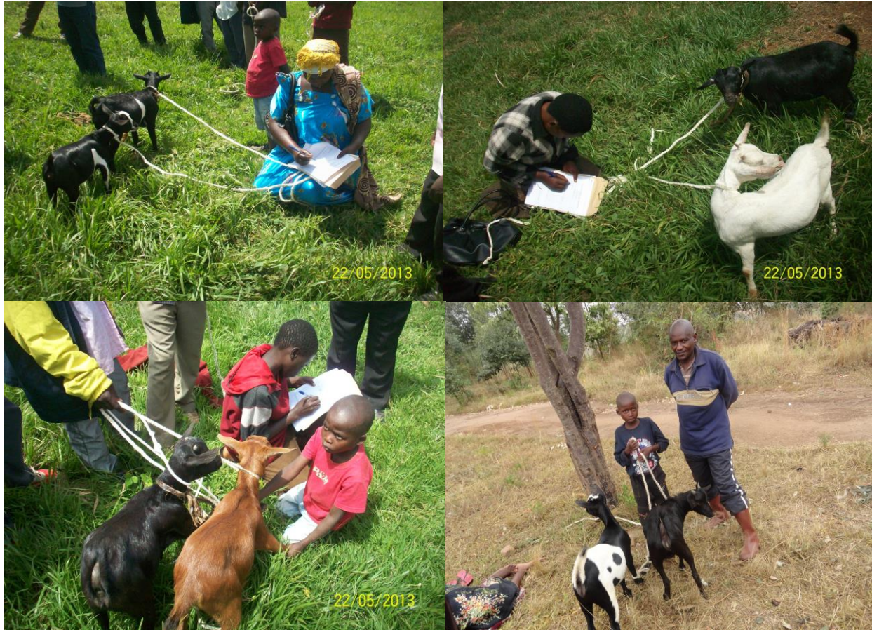
Widows and orphans affected/infected with HIV/AIDS receive goats from RACOBABO under ELCA funding.

The project aims at reduced vulnerability to social and economic effects of HIV& AIDS of targeted households.