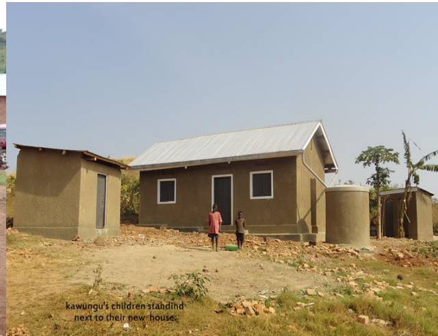
kawungu's children standing next to their new house.