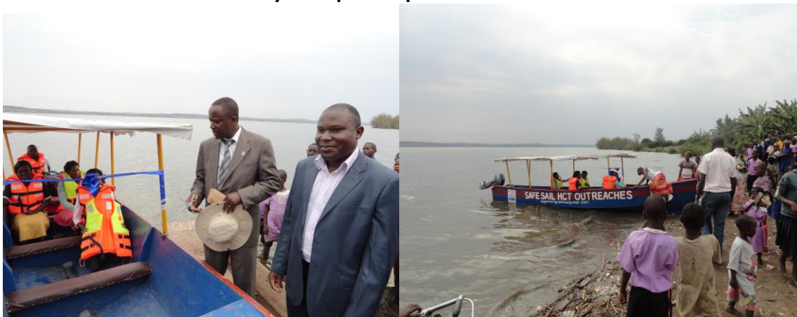
The L.C.V Chairperson of Rakai district launched a Safe Sail Boat that will help health workers carry out HIV/AIDS Counselling and Testing outreaches on the landing sites of Lake Kijanebarora and Lake Kacheera.