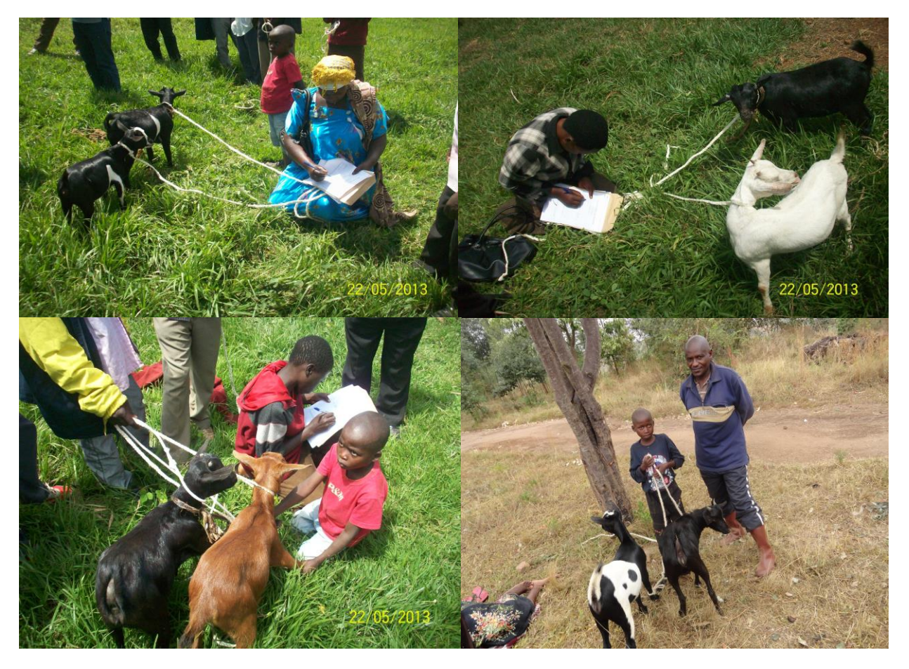
Widows and orphans affected/infected with HIV/AIDS receive goats from RACOBAO under ELCA funding.

The project aims at reduced vulnerability to social and economic effects of HIV& AIDS of targeted households.