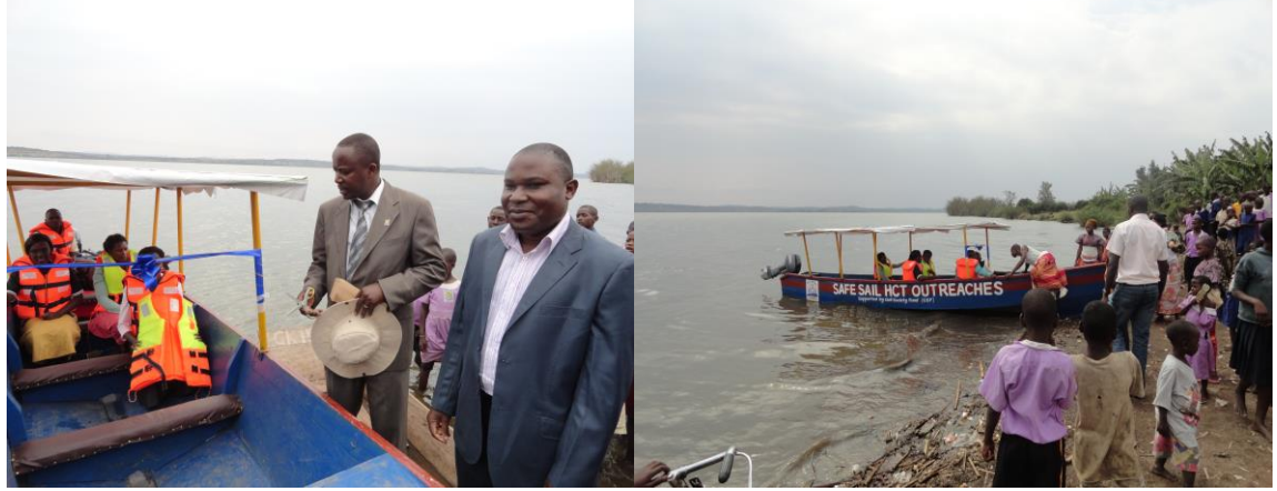
The L.C.V Chairperson of Rakai district launched a Safe Sail Boat that will help health workers carry out HIV/AIDS Counselling and Testing outreacheas on the landing sites of Lake Kijanebarora and Lake Kacheera.