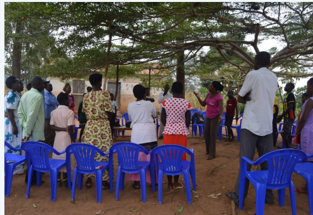
SINOVUYO SESSION S IN LYAKAJURA SUB COUNTY SUPPORTED BY RACOB AO IN PARTNERSHIP WITH RHSP