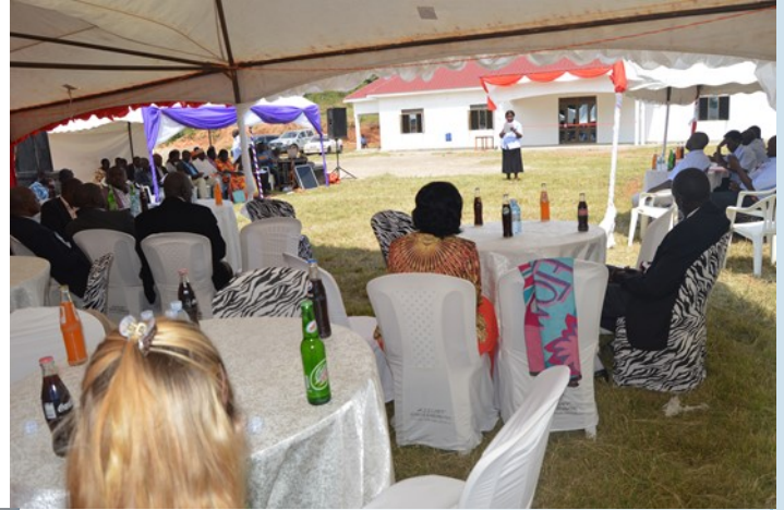
The Head of Finance presenting the Audited financial statement during the Annual General Assembly

the new office block. The delegates discussed key issues concerning the development of RACOBABO. After the AGM, the board members had a retreat with staff for team building.