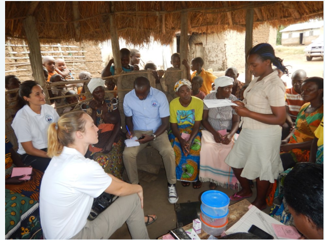
EU AID VOLUNTEERS AND RACOBAO STAFF ATTEND VSLA GROUP MEETING IN RWAMWANJA REFUGEE SETTLEMENT