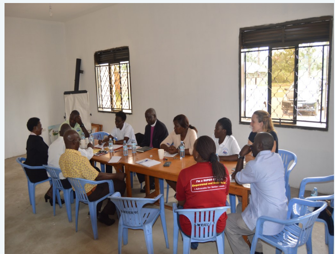
RACOB AO Board of Directors meeting staff