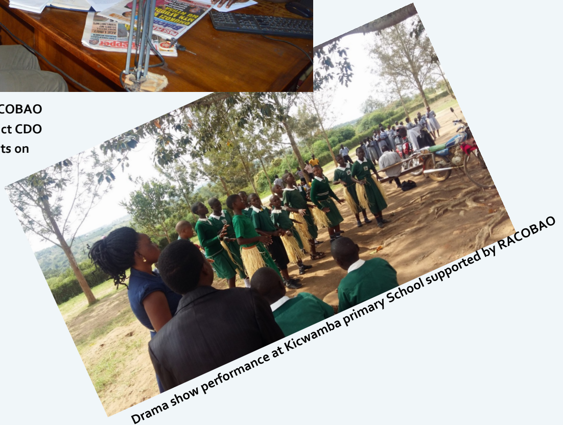
Drama show performance at Kicwamba primary School supported by RACOBAO