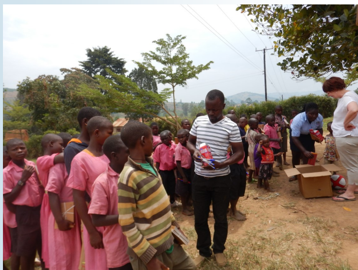
Pupils at Buyanja Primary School receiving scholastic materials from Children in Africa

On the other hand, during 2017, the advocacy issue which RACOB AO in partnership with Chance for Children had pursued overtime, was concluded after Mityana district finally formulated an Education ordinance.