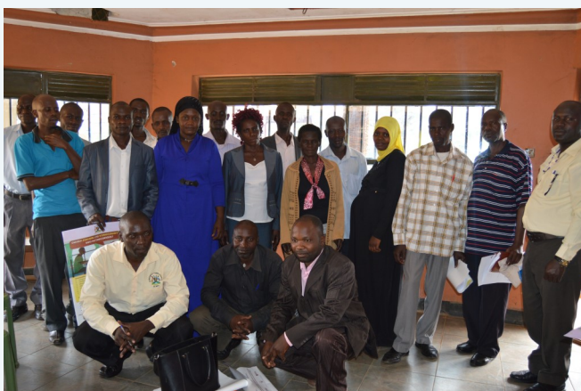
ADVOCACY CHAMPIONS IN SSEMBABULE AFTER THE PLANNING MEETING UNDER THE ADVOCACY FOR BETTER HEALTH PROJECT