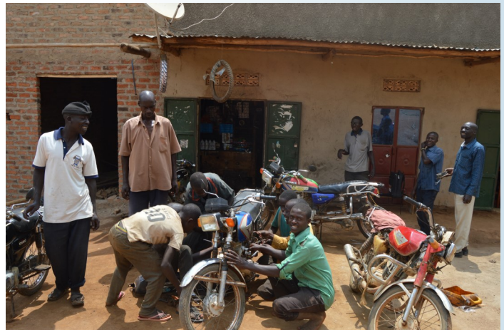
Apprentices attached to a local Artisan in Kicwamba Lyakajura Sub County to attain skills in motor cycle repair

RACOBABO also supported 72 out of school OVC to attain Vocational skills through apprenticeship to enable them sustain themselves. By the end of 2017, the OVC were about to complete their courses in different trades including tailoring and garment cutting, hairdressing, motor cycle mechanics etc with support from Rakai Health Sciences Program.