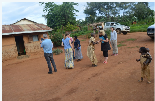
FIELD VISIT BY ICA VISITORS DURING EVALUATION OF THEIR FUNDED PROJECT