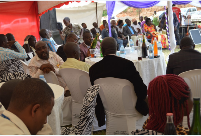
A CROSS SECTION OF DELEGATES AT ANNUAL GENERAL MEETING