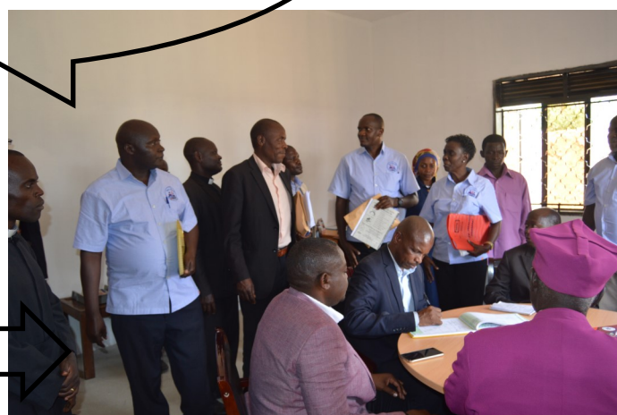
Guests signing the visitors book