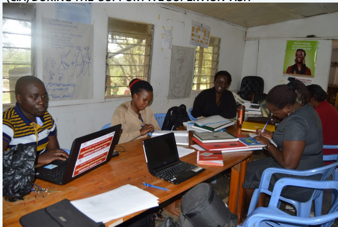
SUPPORT SUPERVISION VISIT BY RAKAI HEALTH SCIENCES PROGRAM