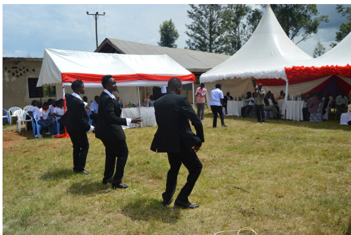
A drama group entertaining the guests