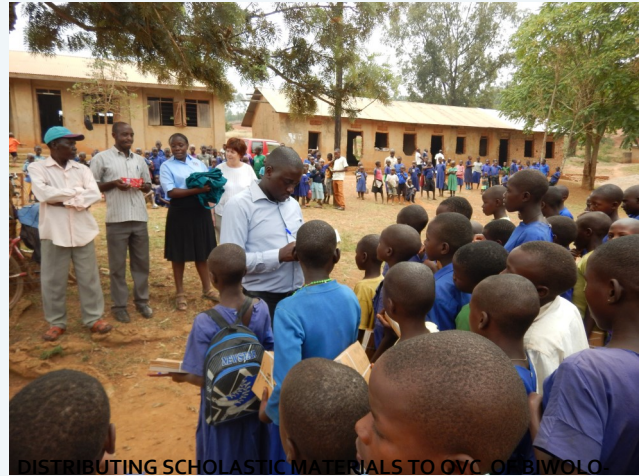
DISTRIBUTING SCHOLASTIC MATERIALS TO QVC OF BIMOLO BO P/S IN PARTNERSHIP WITH CHILDREN IN AFRICA (ICA)