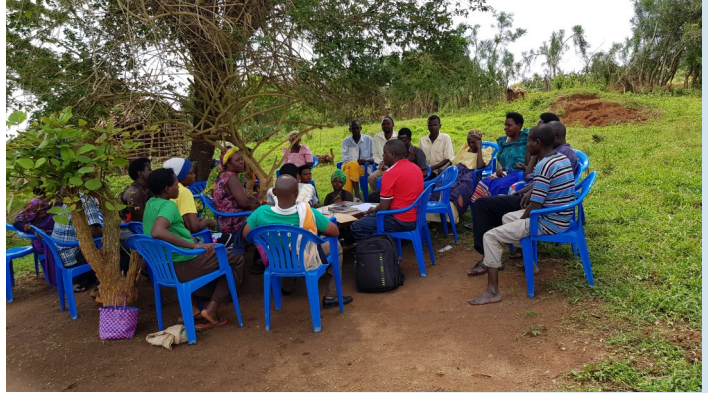
Chairs owned by Abesiga Mukama Basooka Kwavula VSLA members hired out as their income generating venture

The majority of VSLA members have set up IGAs out of which they have been able to meet their needs. The VSLA members and OVC Caregivers were also given entrepreneurship skills to set up Income generating activities as a sustainable measure to meet their needs.