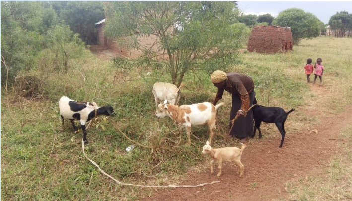
Nabukeera Kellen of Kaliiro proudly tending her goats received from RACOBABO

ELCA and ICA supported livelihood promotion among households affected by HIV and AIDS in Lyantonde and Rakai districts. The economy of such families' collapse after bread-winners become bed-ridden and as such resort to selling off family assets in order to meet medical requirements. When they regain physical fitness, there is usually no source of income to sustain their families. By giving them goats, RACOBABO contributes to rebuilding the economy of such households as the goats are easy to look after and multiply fast enabling the families to sell off-springs and meet the basic needs.