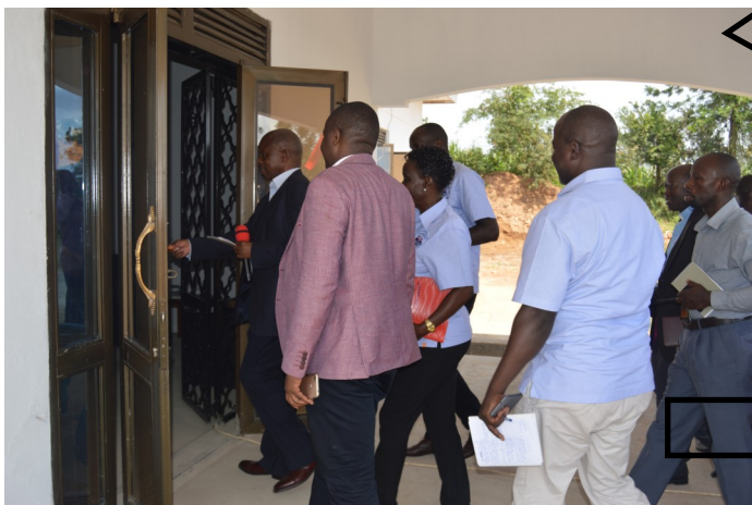
Chairperson LCV Lyantonde leading guests into the new office