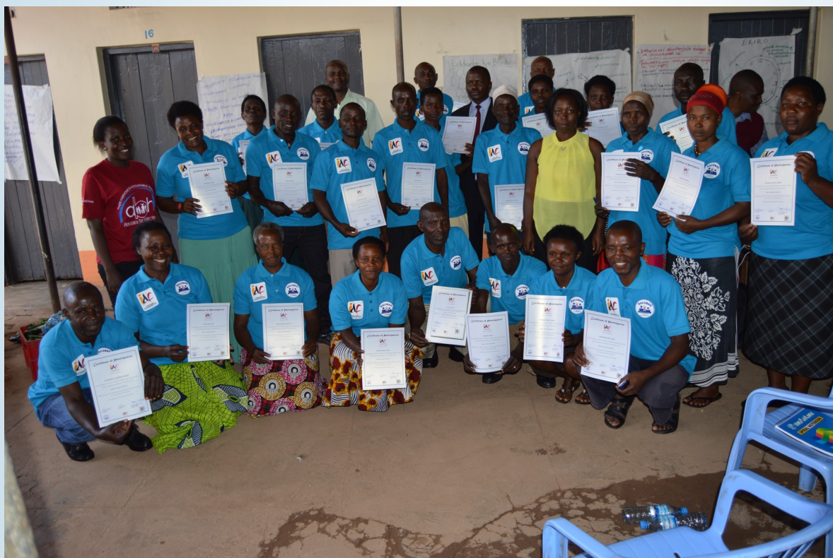
Para-legals after the refresher training conducted by RACOB AO with IDF's support

RACOB AO's interventions have led to Community members vigilance in reporting cases of child abuse to the relevant offices, increased school enrollment and retention since the community is now aware of the child protection Bye-law.