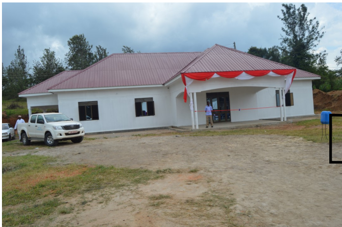
RACOB AO's new office building