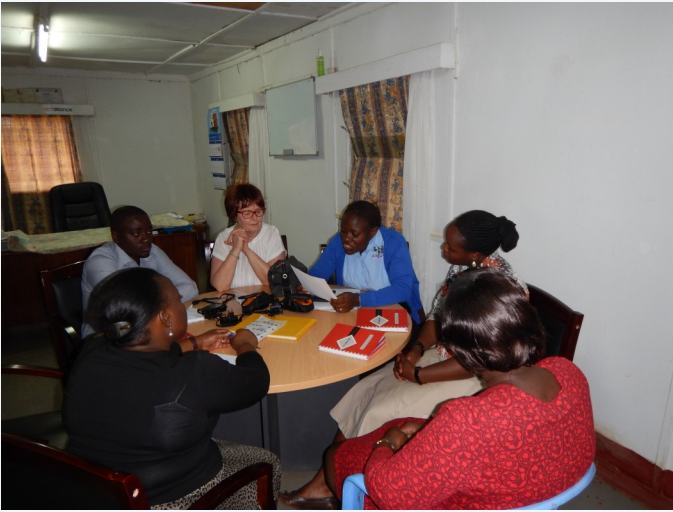
RACOBAO STAFF MEETING VISITORS FROM CHILDREN IN AFRICA (CIA) DURING THE SUPPORTIVE SUPERVISION VISIT