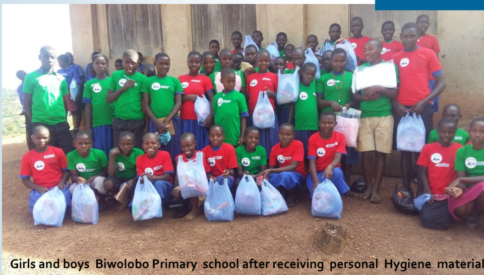
Girls and boys Biwolobo Primary school after receiving personal Hygiene materials during the youth camp

....the harmful cultural practices and reluctance in law enforcement were responsible for high school drop out especially among the girls thus exposing them to risk of HIV