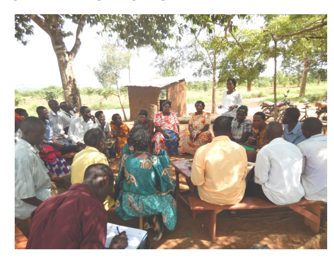
Cultural leaders dialoging on status of child welfare during one of the meetings at Lyakajura.

The meeting was conducted at Kabundabunda village and was attended by 20 (14F). The aim of the meeting was to build the capacity of government and cultural leaders to sensitize their communities on children rights / child rights abuses. The meeting was also intended to emphasize the role of leaders in protection of child rights in their communities