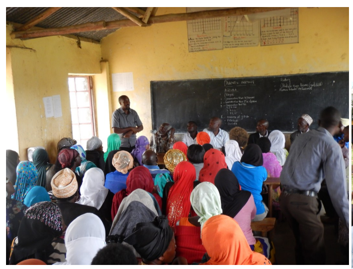
Meeting at Kyabbuuza Primary school in March 2017

of children Act and extracts of the Ugandan con- to other schools and communities to ensure that stitution on children rights in effort to popularize them. 100 copies were disseminated and place for children. distributed during a meeting which was held at RACOBAO is optimistic that the increased com-Kyabbuuza primary school in March 2017.