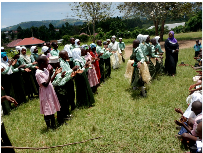
Pupils of Kyabbuuza Primary school staging an MDD show on children rights

Schools have been conducting drama sessions through which children have been empowered to defend their rights.