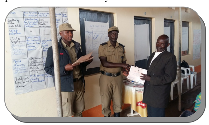
A cultural leader receiving a certificate from the OC Lyantonde police station