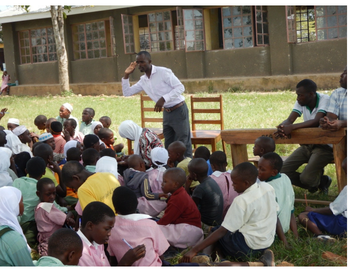
OVC Focal Person Lyantonde District during the meeting

munity awareness will lead to more community vigilance in monitoring child abuse and reporting cases to the relevant Authorities.