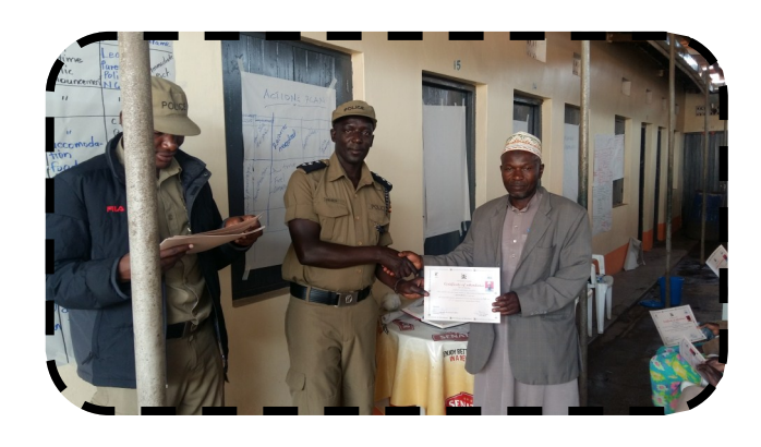
Imam from Lyantonde receiving a certificate from the OC Lyantonde police station