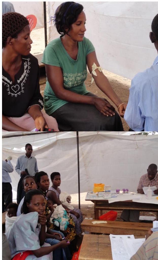
Women and men attending the HIV/AIDS Counseling and Testing services at Lwanga landing site during an outreach on Lake Kacheera.

Through this project in the 04 sub-counties of Kacheera, Lwamaggwa, Dwaniro and Kagamba, RACOB AO aims at; Increasing demand and utilization of HIV prevention services among men and women, Increasing adoption of safer sexual practices, creating a sustainable enabling environment to mitigate socio-cultural and structural drivers of HIV/AIDS epidemic, Strengthening coordination and referral mechanisms among HIV/AIDS service providers, Strengthening the monitoring and evaluation system of RACOB AO and the consortium members to monitor and measure project outputs and outcomes in the targeted sub counties.