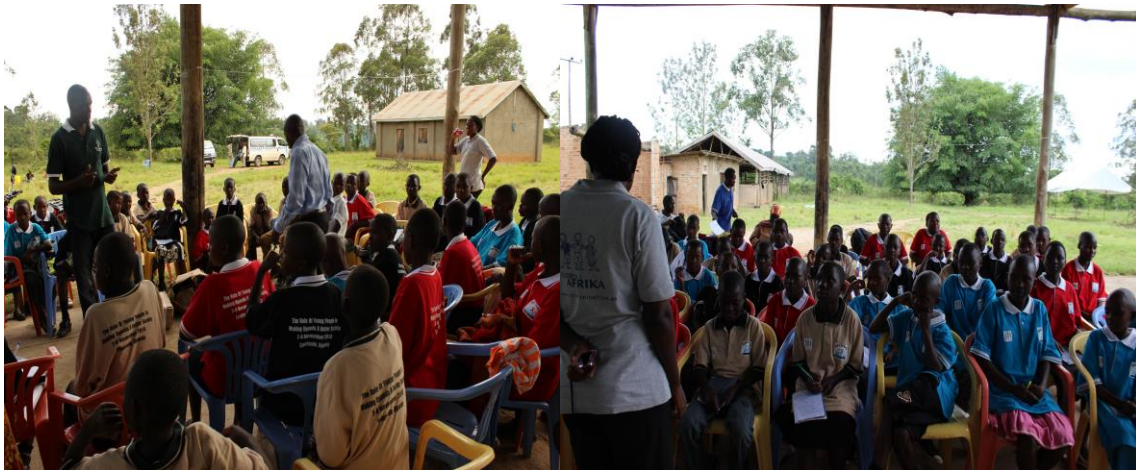
RACOB AO conducted a 02 days camp for orphans from Child Headed Households.